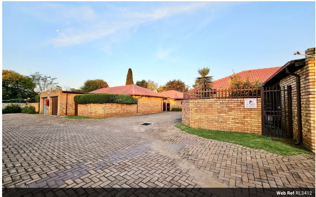
Web Ref RL3412

Entrance 9, Gleneagles Office Park, Koorsboom Ave, Glen Erasmia x22, Kempton Park, 1619